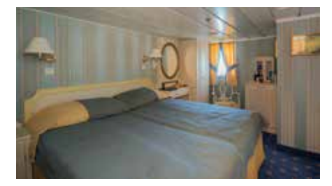
DELUXE STATEROOM (15 to 25 square metres)