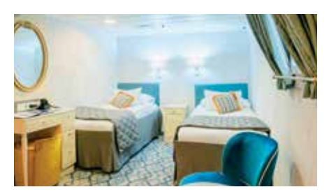
CLASSIC STATEROOM (14 to 19 square metres)