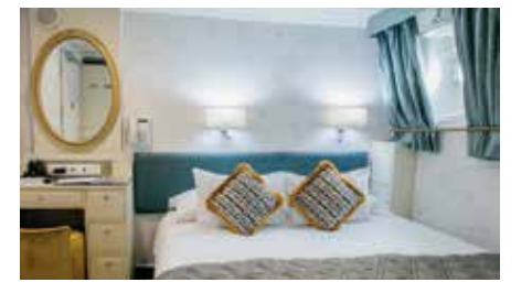
STANDARD STATEROOM (10 to 11.5 square metres)