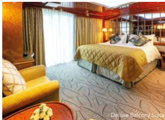
Deluxe Balcony Suite