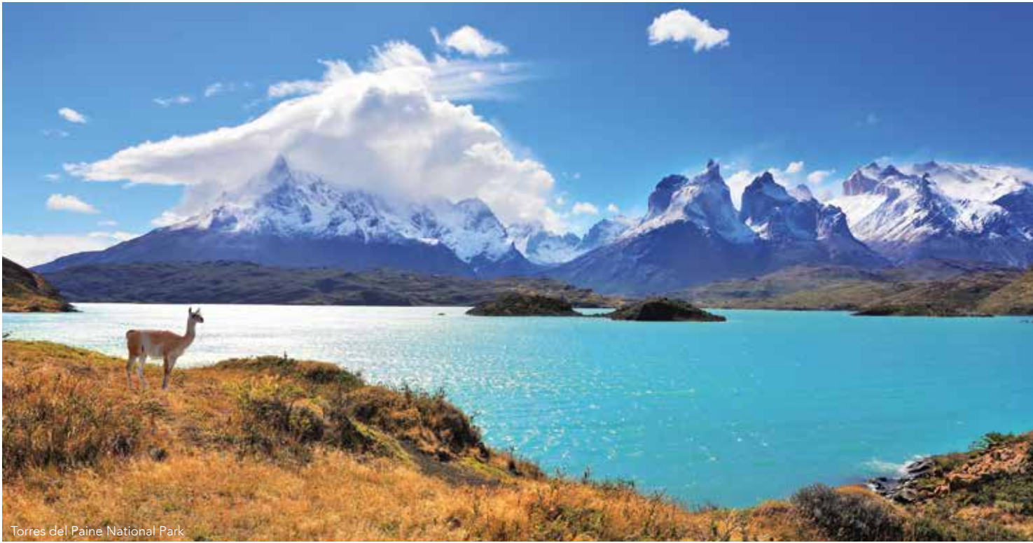
Torres del Paine National Park

Those who have a passion for the wilder places on our planet usually have Patagonia on their must do list. Shaped by fire and ice, this rugged, yet hauntingly beautiful land of windswept pampas, hanging glaciers and cloud piercing peaks, remains today as enticing and fascinating as it did to Magellan, Drake and more latterly Darwin.