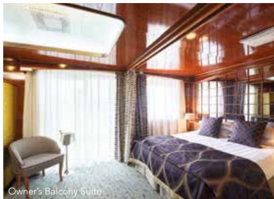
Owner's Balcony Suite