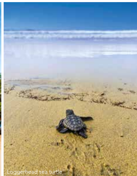
Loggerhead sea turtle