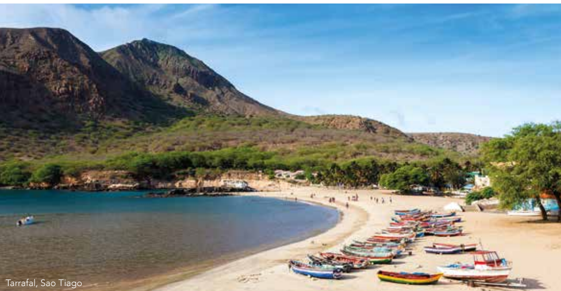
Tarrafal, Sao Tiago