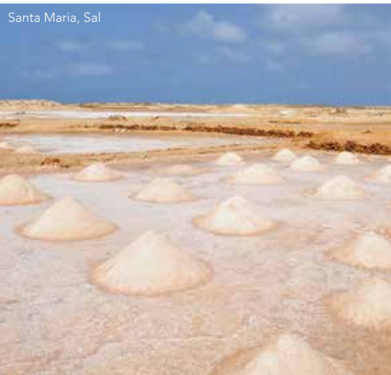
Santa Maria, Sal