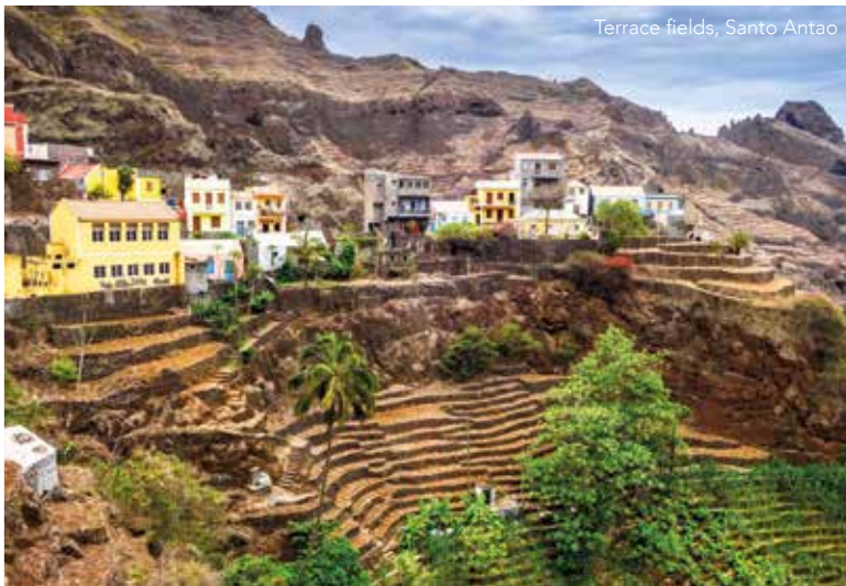
Terrace fields, Santo Antao