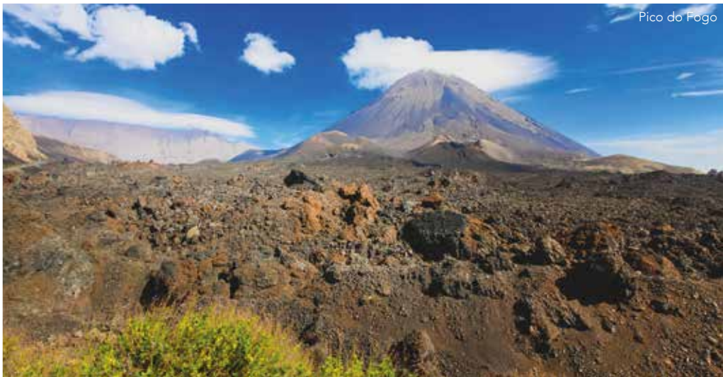
Pico do Fogo