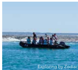
Exploring by Zodiac

Day 12 Praia to London. Disembark this morning and transfer to the airport for our exclusively chartered flight to London.