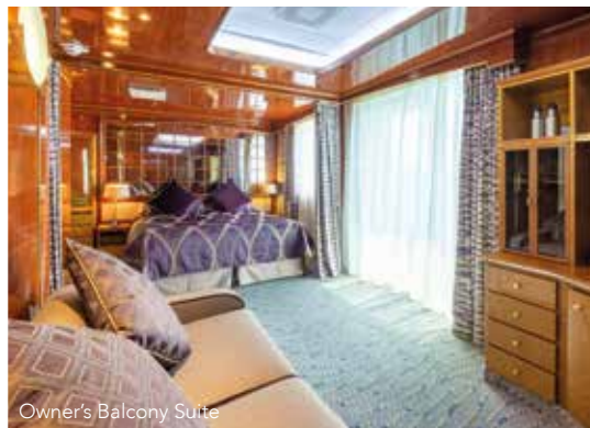
Owner's Balcony Suite