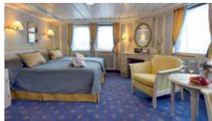
OWNER'S SUITE (22 square metres)