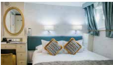
STANDARD STATEROOM (10 to 11.5 square metres)