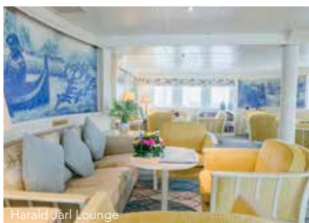
Harald Jarl Lounge