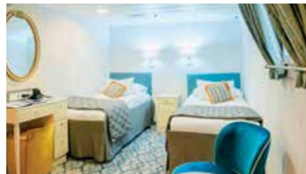
CLASSIC STATEROOM (14 to 19 square metres)