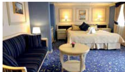
SERENISSIMA SUITE (25 square metres)

NB. Please note cabin sizes vary in each category and measurements shown are approximate.