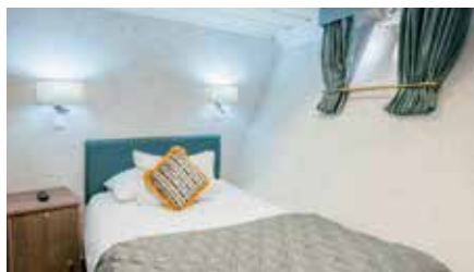
STANDARD SINGLE (7 to 12.5 square metres)