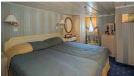
DELUXE STATEROOM (15 to 25 square metres)