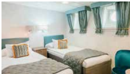
SUPERIOR STATEROOM (11.5 to 18 square metres)