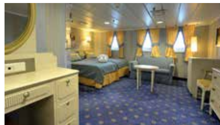
JUNIOR SUITE (21 square metres)